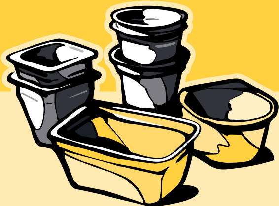
Yogurt pots and other dairy plastic cups