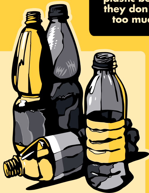
Plastic bottles and boxes